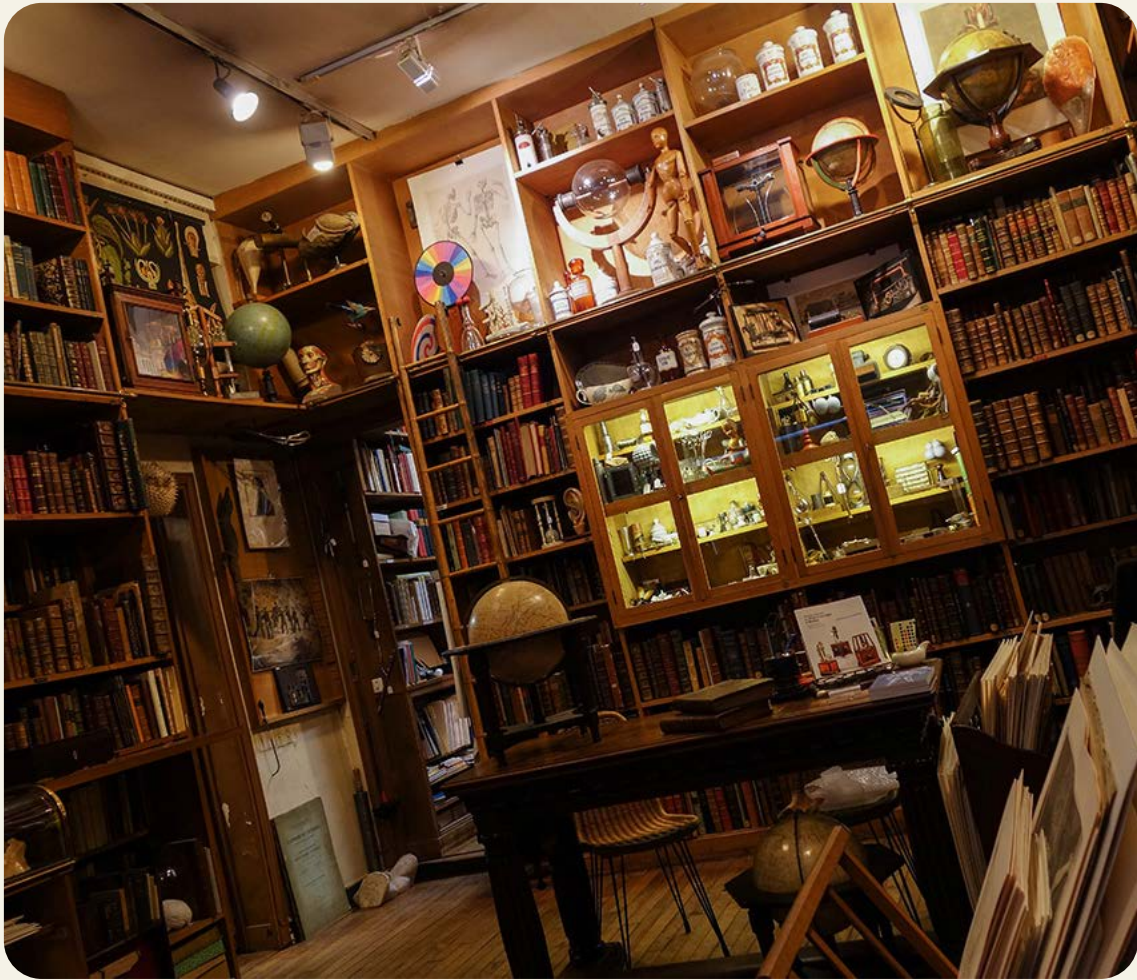
Librairie Alain Brieux