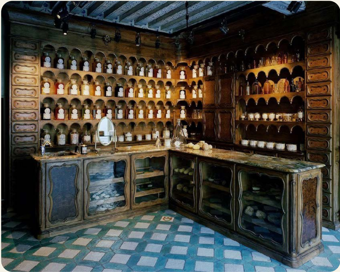
Officine Universelle Buly 1803