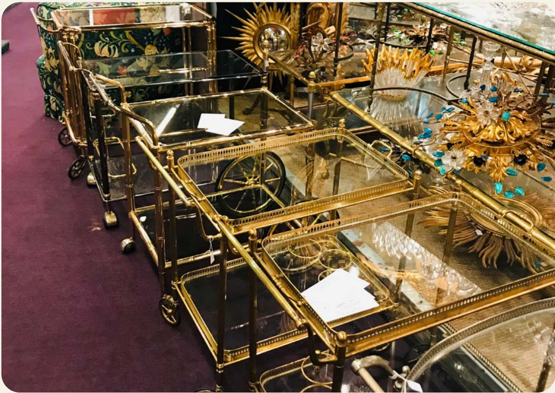
In the Marché Paul Bert Serpette