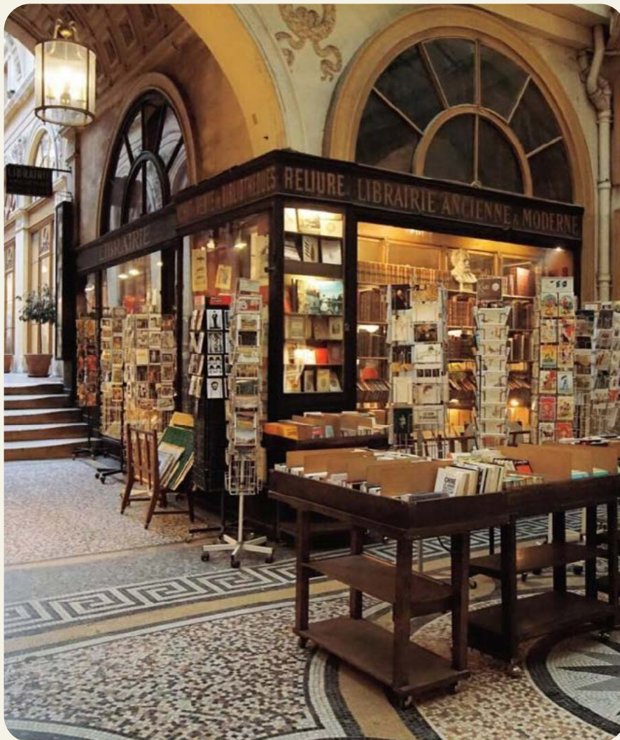
Librairie F Jousseume