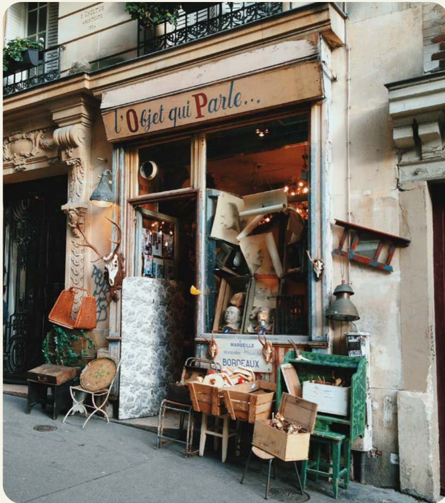
L'Objet qui Parle

(86 rue des Martyrs; 18eme, open 1-7.30pm, closed Mon, website ).