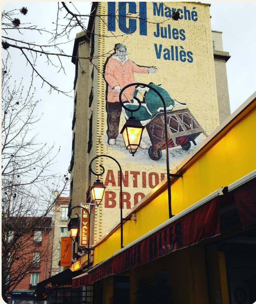
Marché Jules Vallès

(7 and 9, rue Jules Vallès 93400 Saint-Ouen, Thur and Friday from 7am - 12 pm, Sat & Sunday from 9:30am to 5:30pm. Monday 10:30am to 3.00pm).