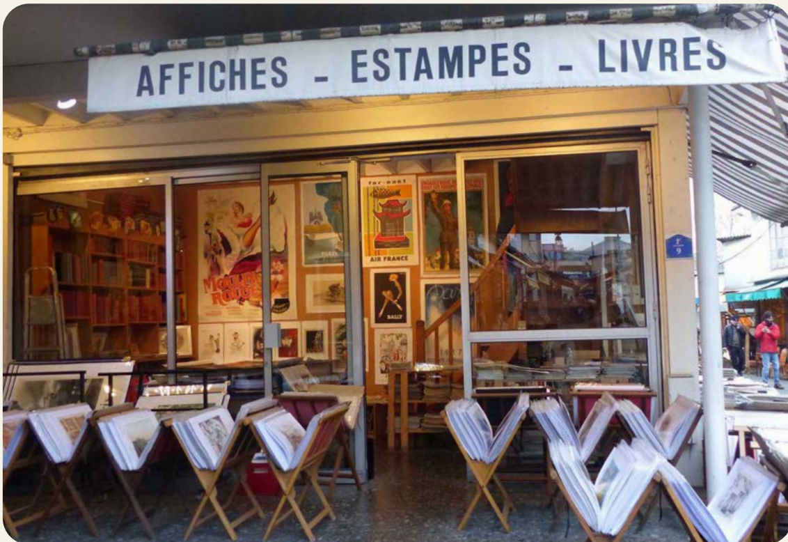
The Paul Maurel gallery

An excellent collection of vintage posters, from the early Perrier ads to Art Deco Grand prix prints. Browse their collection at Allée 1 Stand 41 .