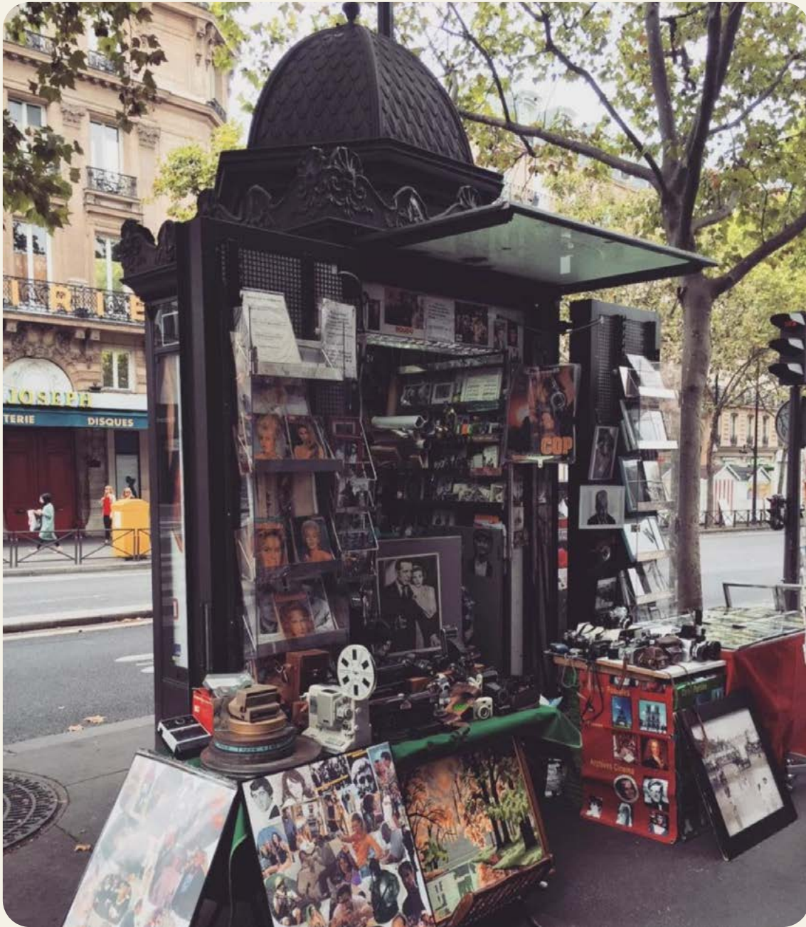
Vintage Camera Kiosk