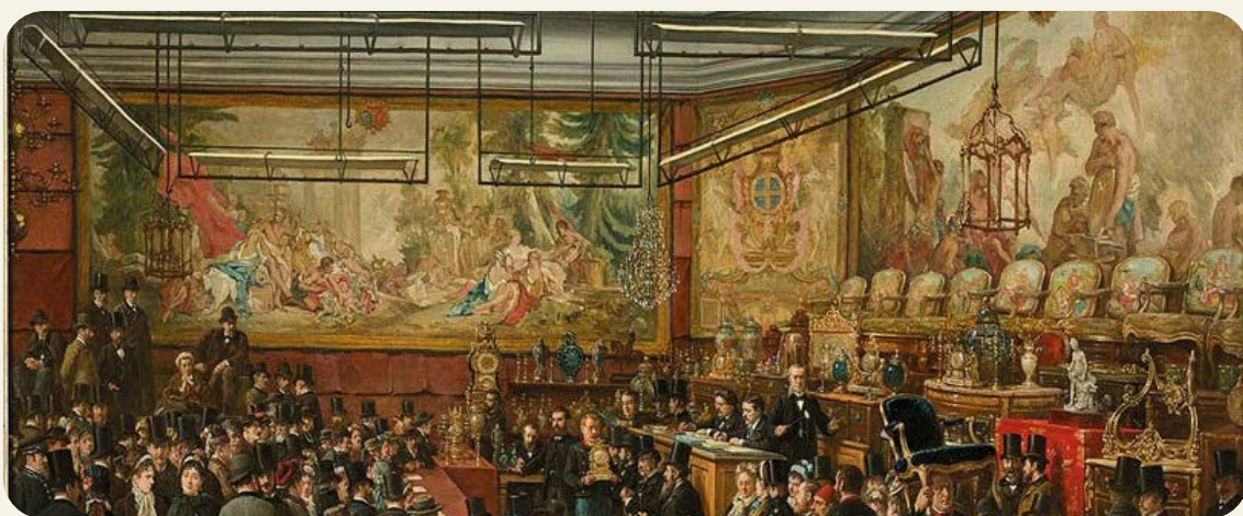
A painting of Drouot