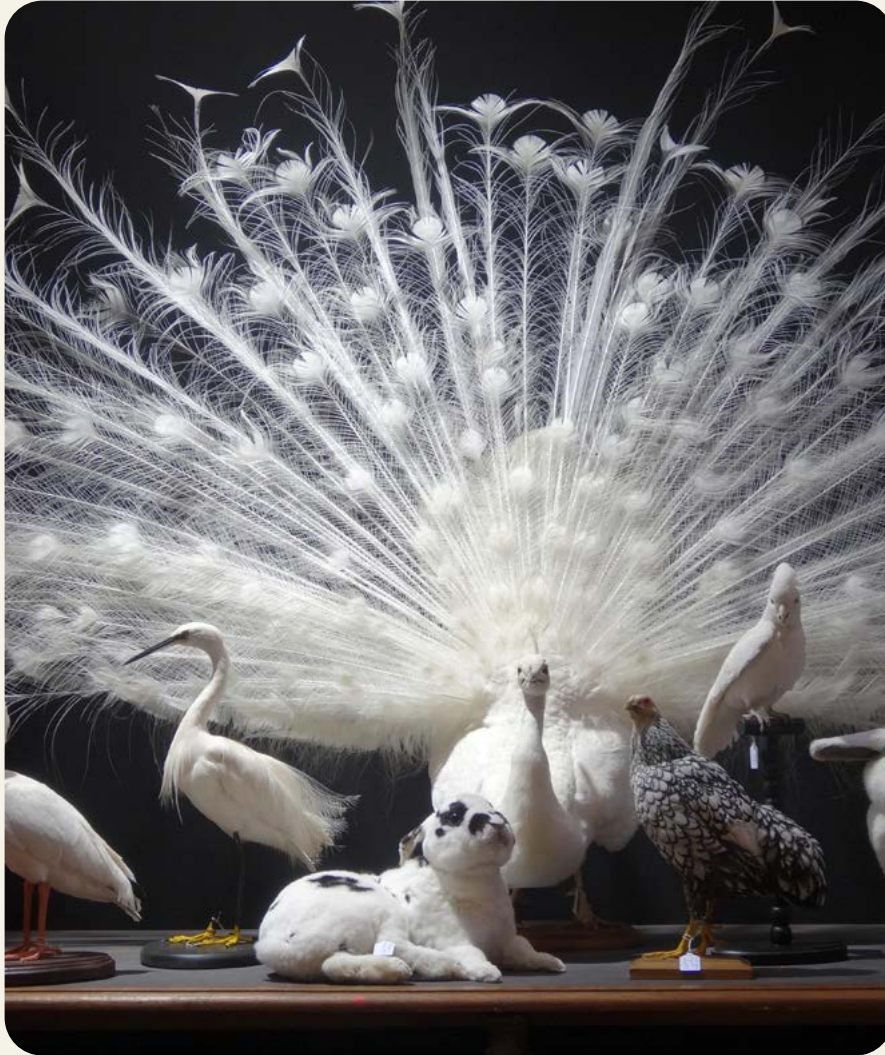
Design et Nature