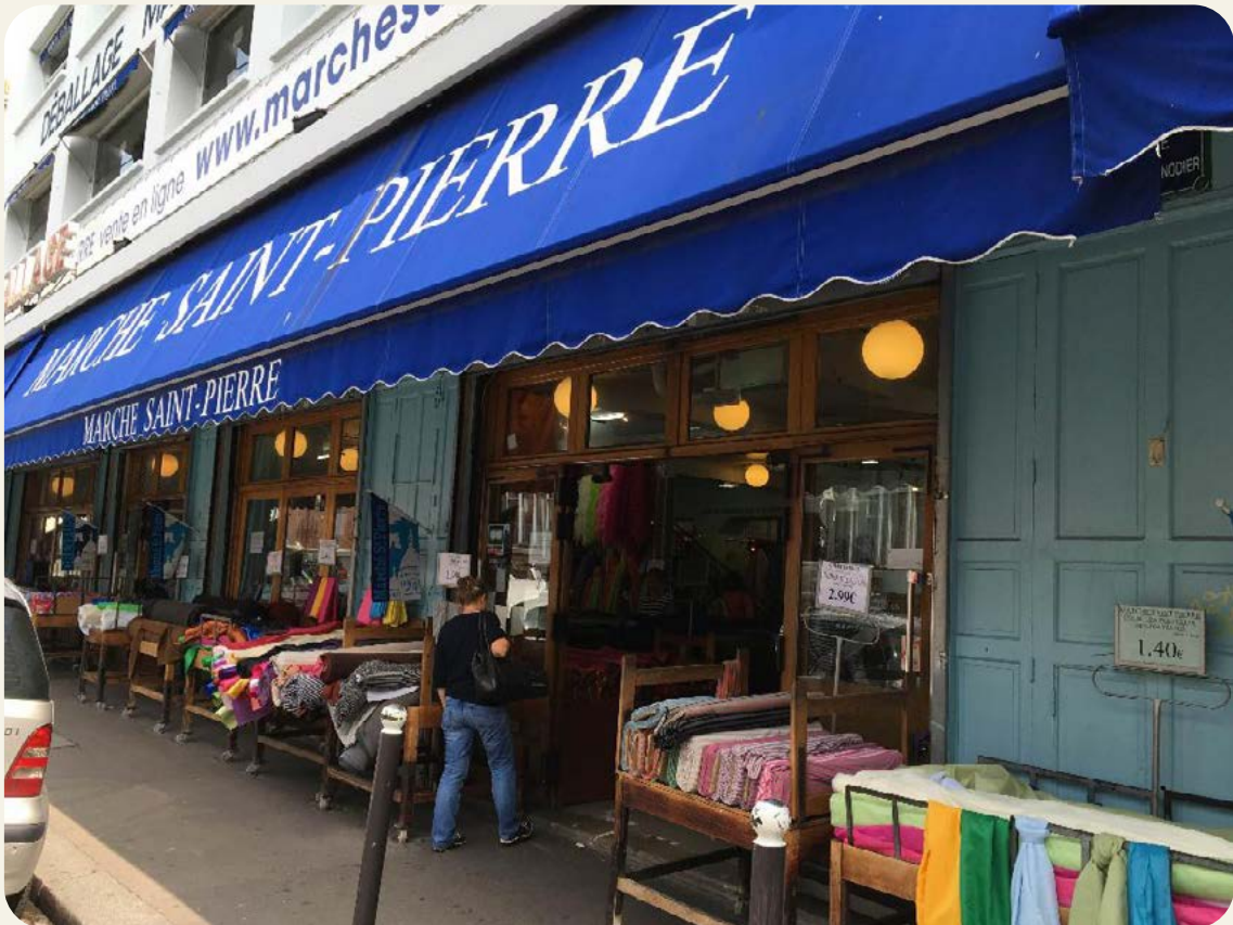
Marché St Pierre

(17 rue Moret, 11ème; casablanca polo.com).