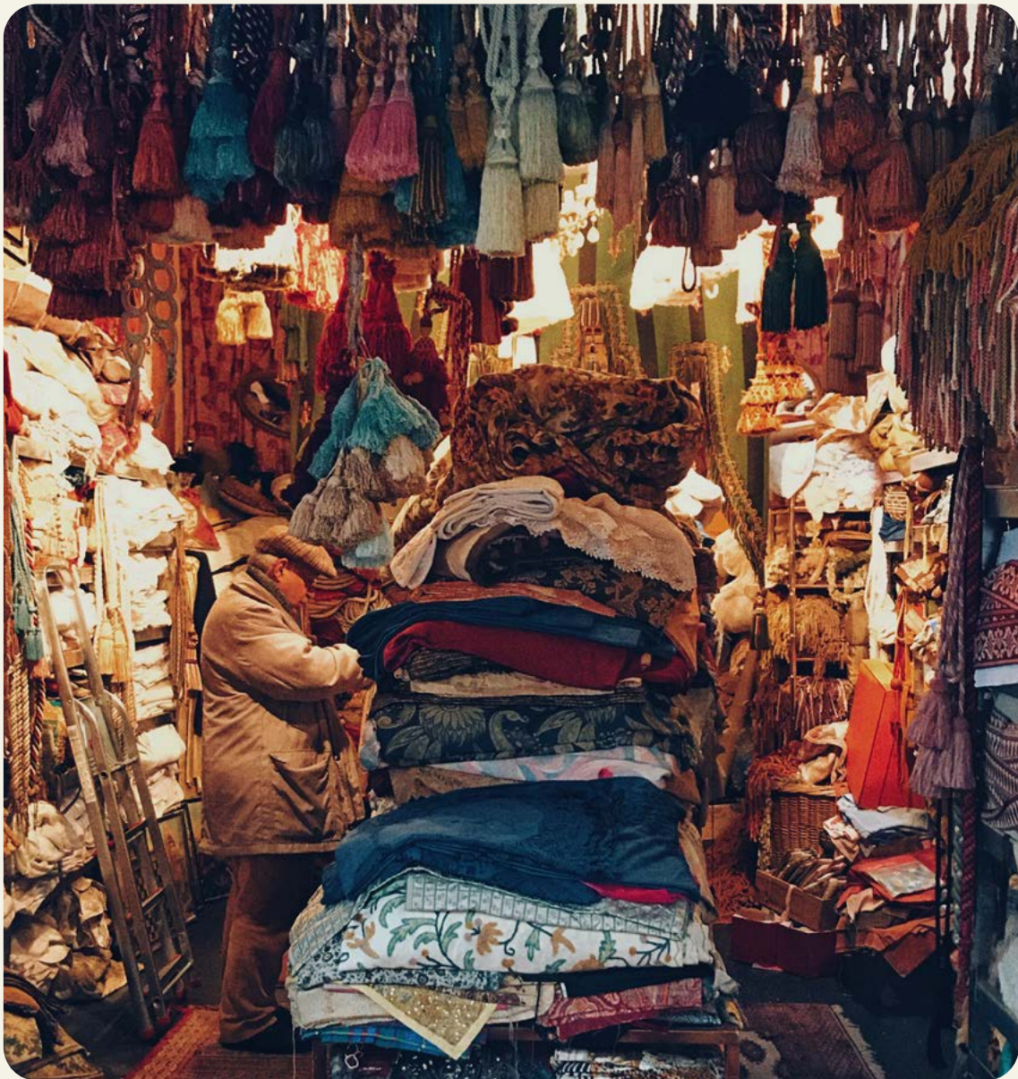
Marché des Vernaïson