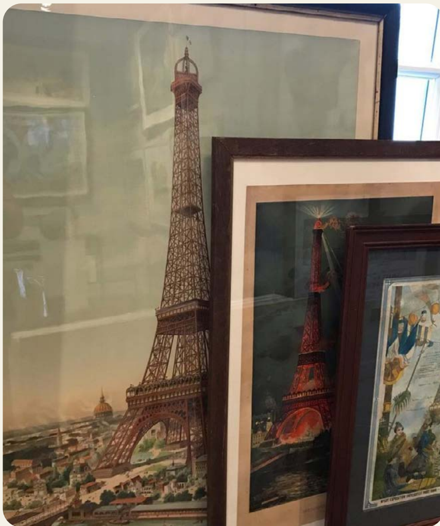
Galerie Martinez Fleurot

(97 rue de Seine, 75006, Open Tues – Sat 10.30am-7pm).