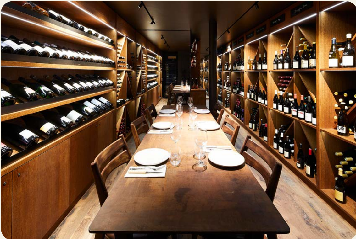
The wine cave at Francette

(Port de Suffren, 75007 Paris; Capacity: multiple rentable spaces from 6-10+; francette.paris; +33 06 68 94 26 82)