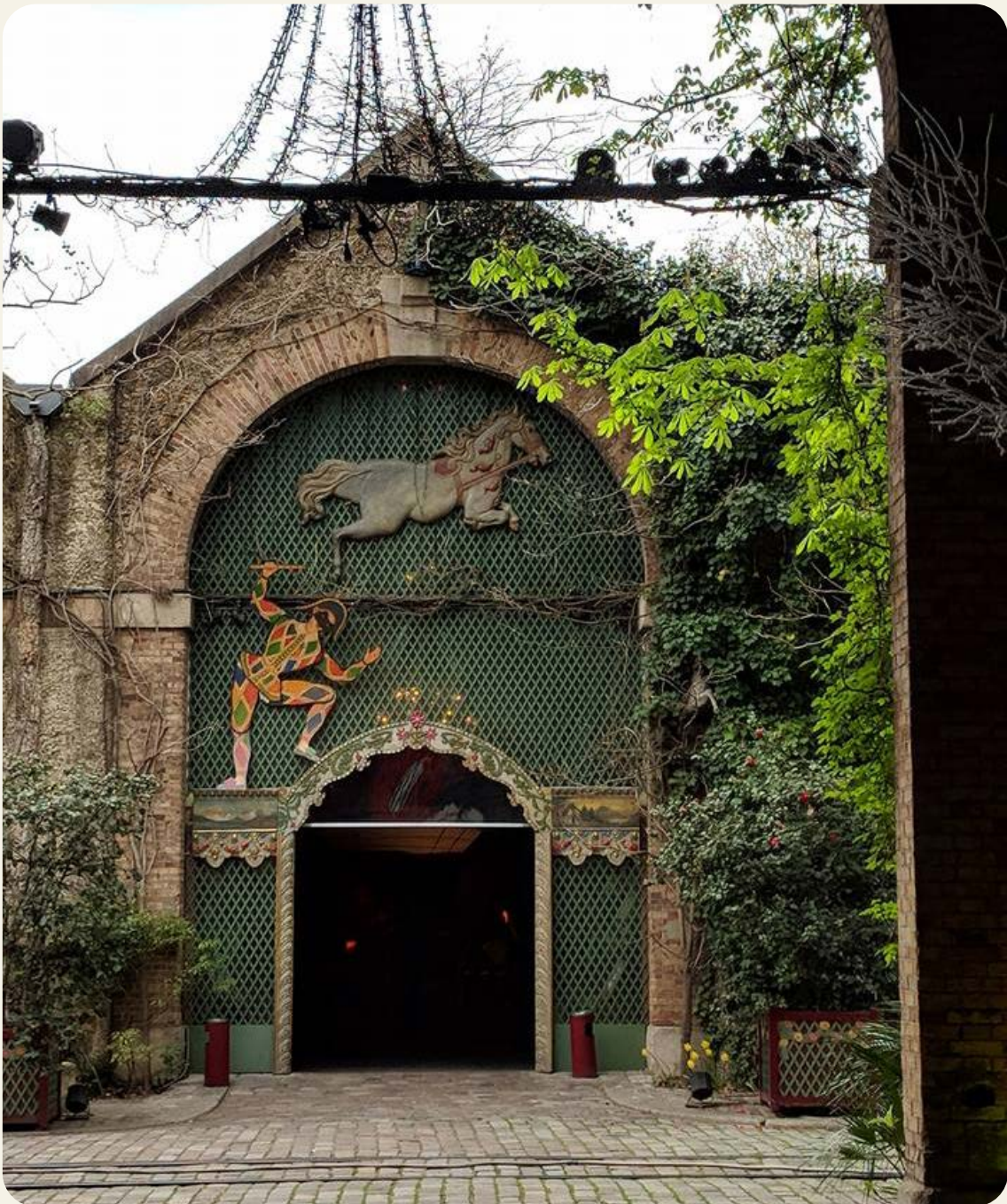
Cour du Mûrier

The Musée des Arts Forains is my favourite museum in Paris, possibly the world, an Alice in Wonderland type of place, it's the result of one man's fascination with rare funfair objects, games, toys, theatrical props and other lost treasures dating back to the 1800s, set in the nineteenth-century wine storehouses, where old train tracks still run through the cobblestoned streets in between the pavilions.