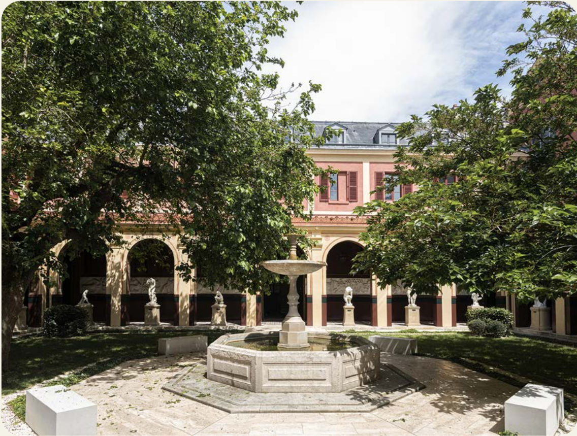
Cour du Mûrier

(14 rue Bonaparte, 6eme, Capacity: 200; Inquire and reserve here: beauxartsparis.fr/fr/privatisations/cour-du-murier )