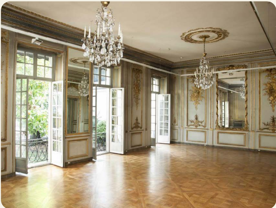
Hotel Mona Bismarck

(34 avenue de New York, 75116; Inquire for more details: info@americancenterparis.org or +33 1 47 23 38 88)