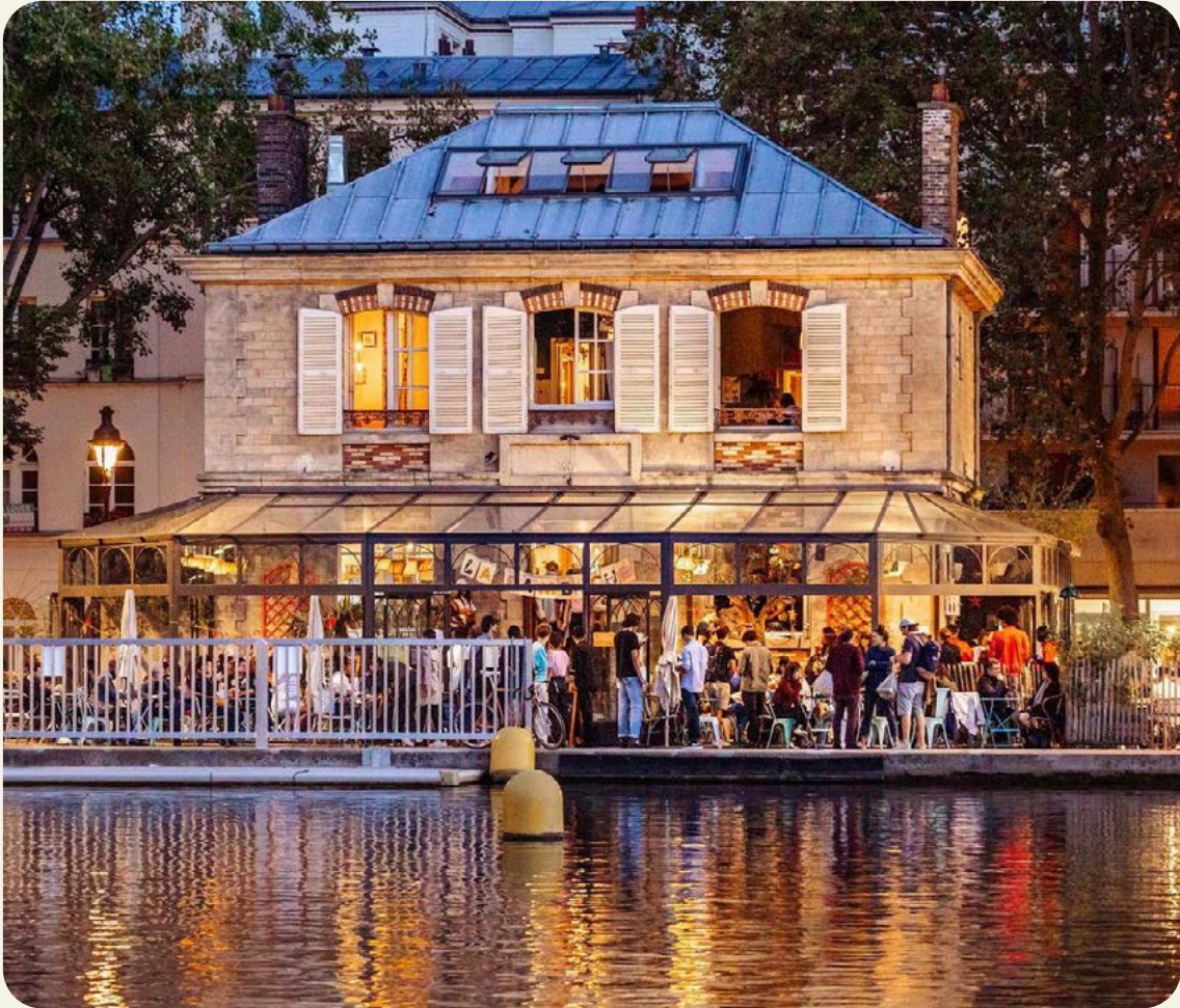
Le Pavillon des Canaux