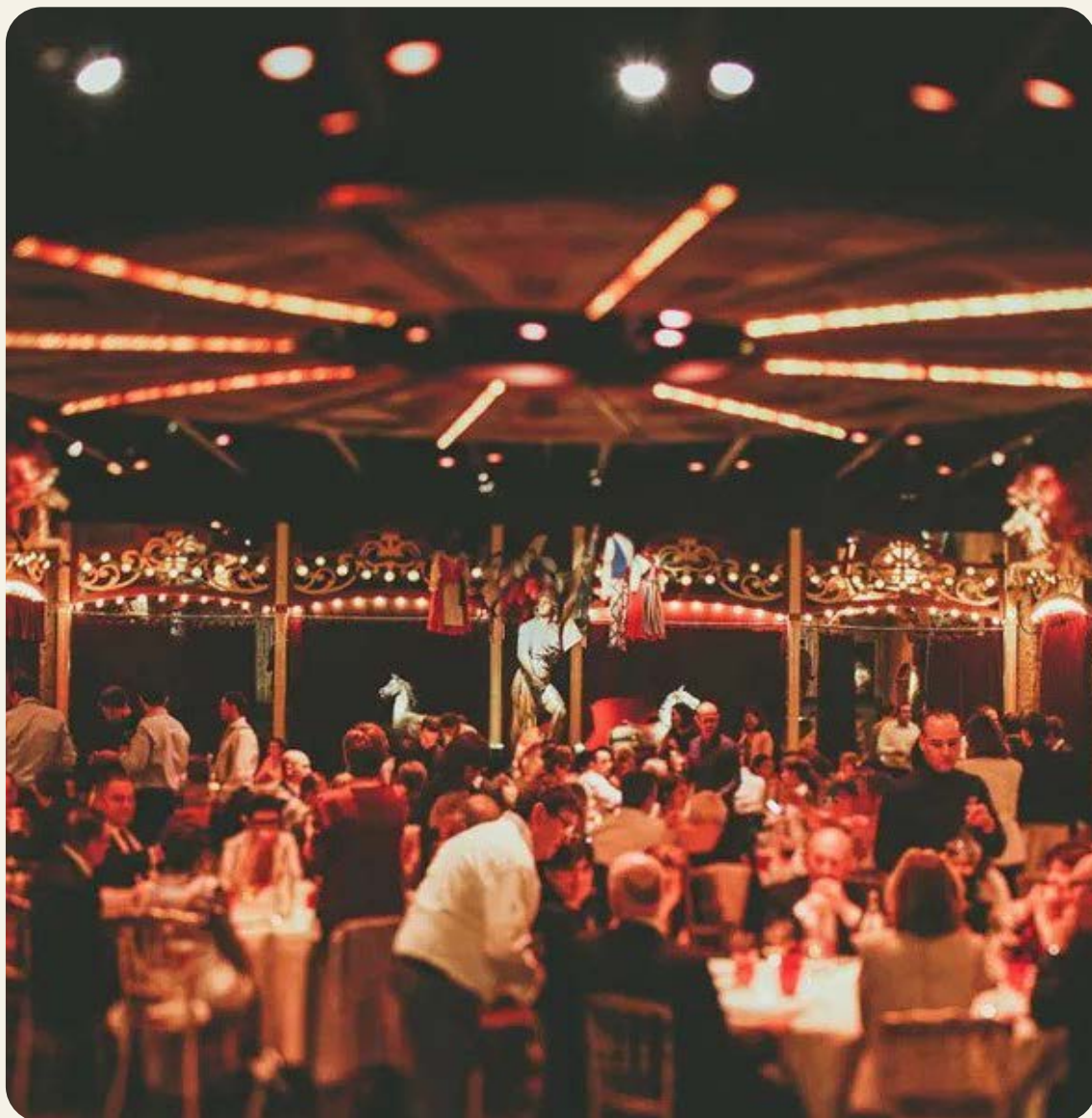
Musée des Arts Forains