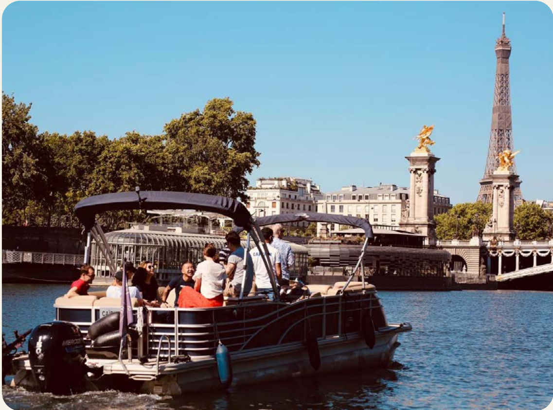
Green River Cruises

If you'd rather be motorboated around in luxury and you have a bigger budget, you could have drinks on your own pontoon boat with a chauffeur starting at 50 euros per person. Take things up a notch with your own private Riva boat and live La Dolce Vita on the Seine.