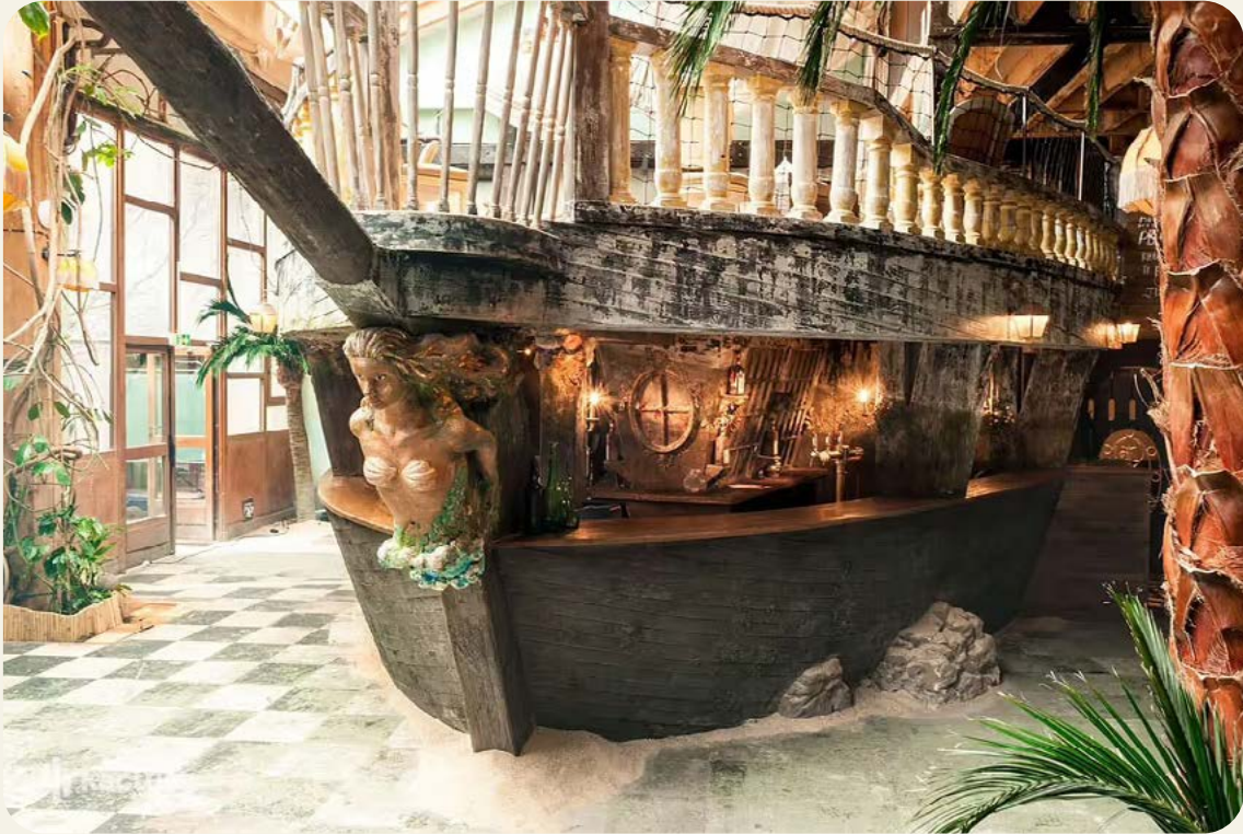
Le Comptoir General

(80 Quai de Jemmapes, 10ème; Lecomptoirgeneral.com )