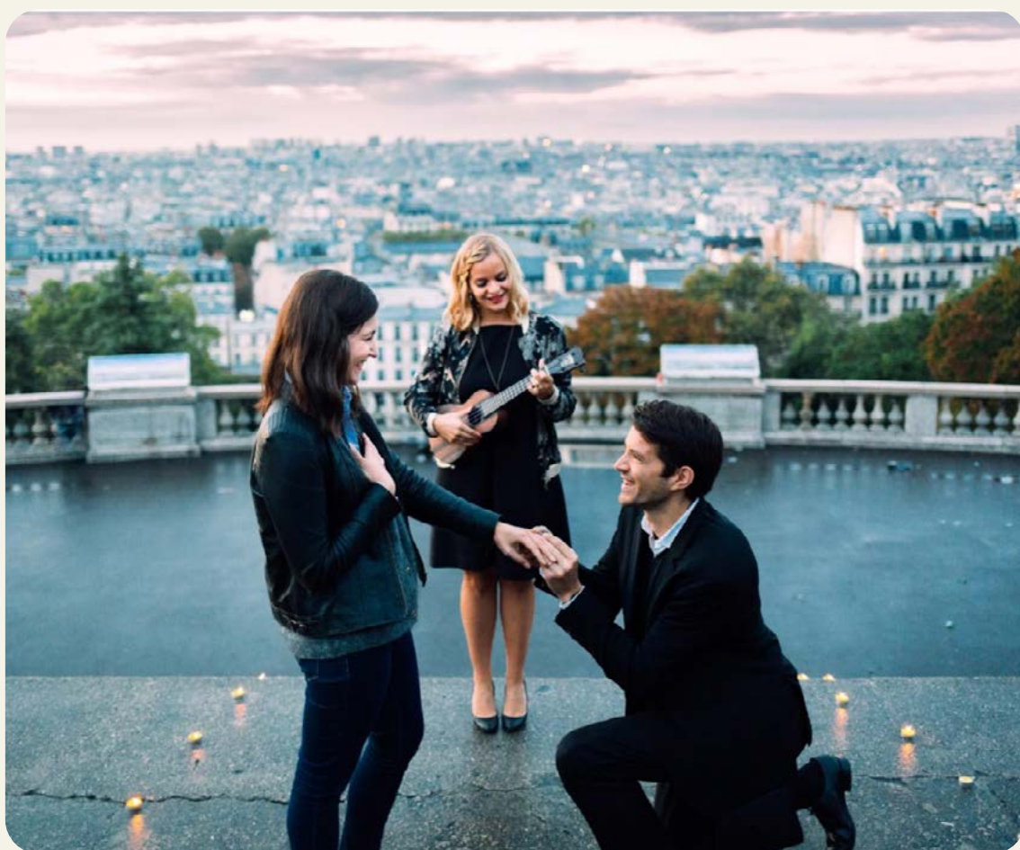
Hotel de Montgascon