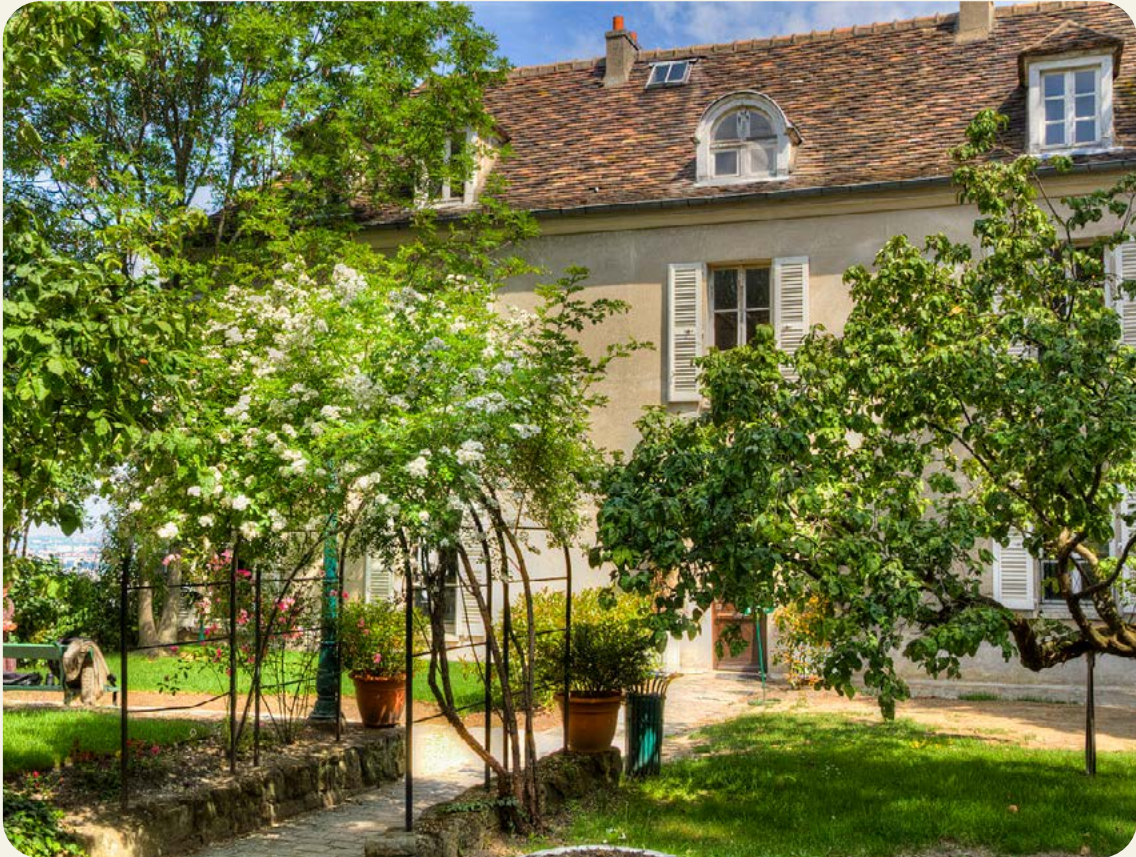
The Musee de Montmartre

(12 Rue Cortot, 75018; Capacity: 50-350 depending on space; Inquiries: Musee-demontmartre.fr/organiser-un-evenement-au-musee-de-montmartre ; +33 1 49 25 89 39)