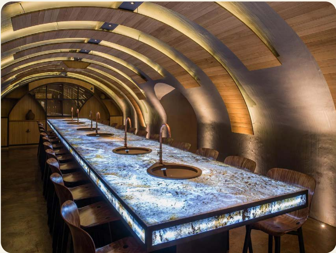
Les Caves du Louvre

(52 rue de l'arbre sec 75001; 1 40 28 13 11; Capacity: small groups, request a quote online for more information: Cavesdulouvre.com )