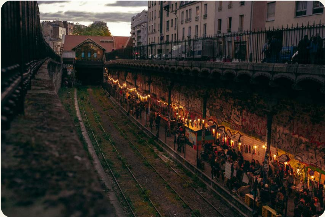
Le Hasard Ludique

Le Hasard Ludique is a converted Belle Époque ghost station with a train platform that doubles as an open air café terrace. They can take from 280 to 800 people depending on what space you choose, which includes the trackside area, but also a performance stage area inside the old station.