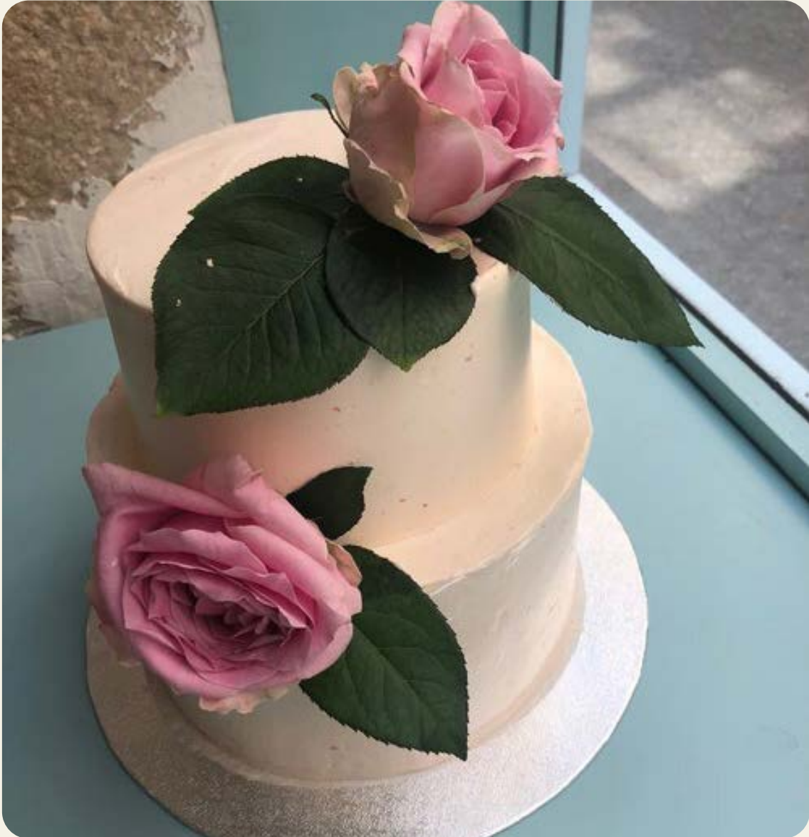
Madame de la Maison

Also, no matter what venue you're at, if you have some little accents you'd want to add – you could also dress it up with the help of someone like Madame de la Maison , run by a lovely American girl who collects vintage plates, glassware, linens etc and helps style dinner parties & events of all sizes, for a very reasonable price.