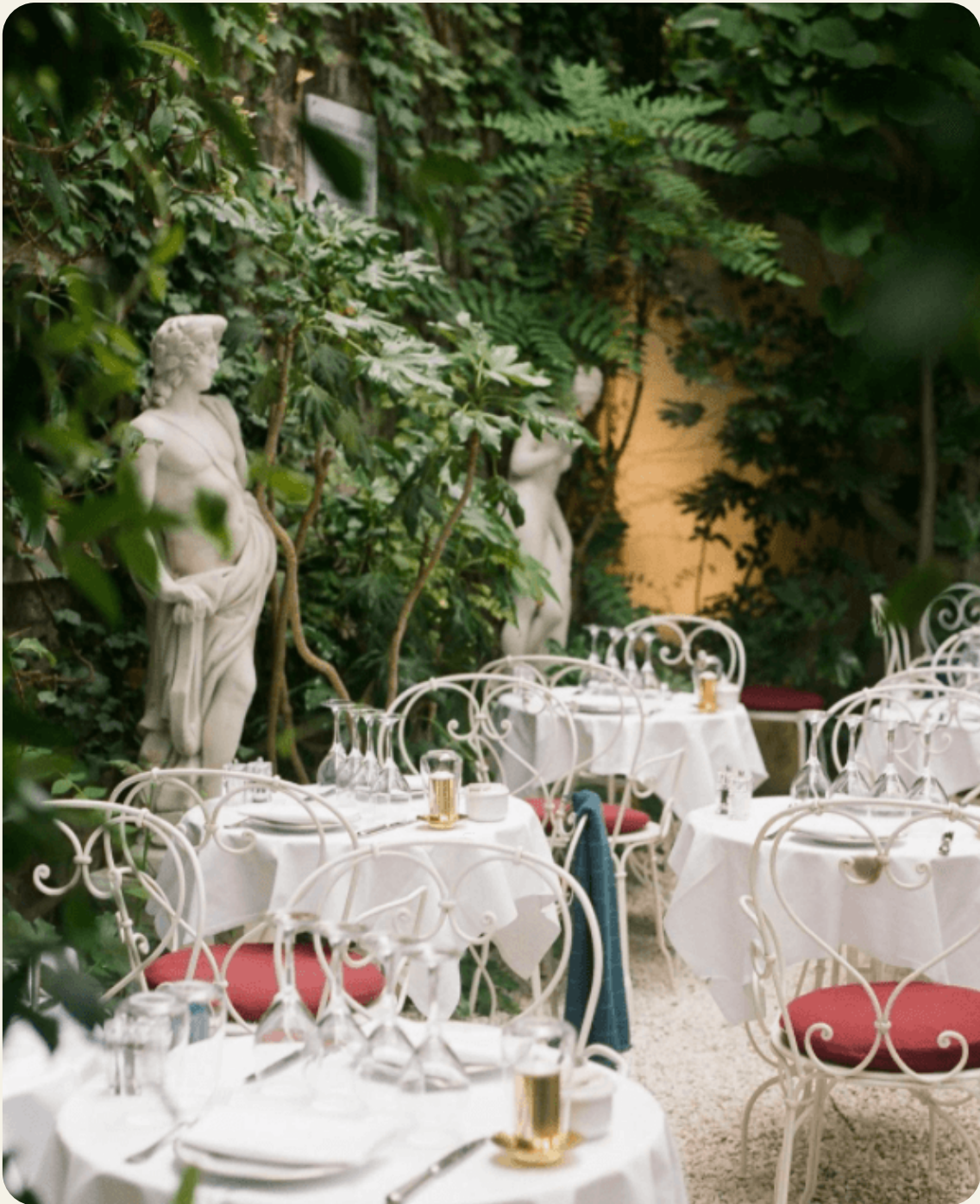
Hotel Particulier de Montmartre

(23 Av. Junot Pavillon D, 75018 Paris, hotelparticulier.com/?lng=en )