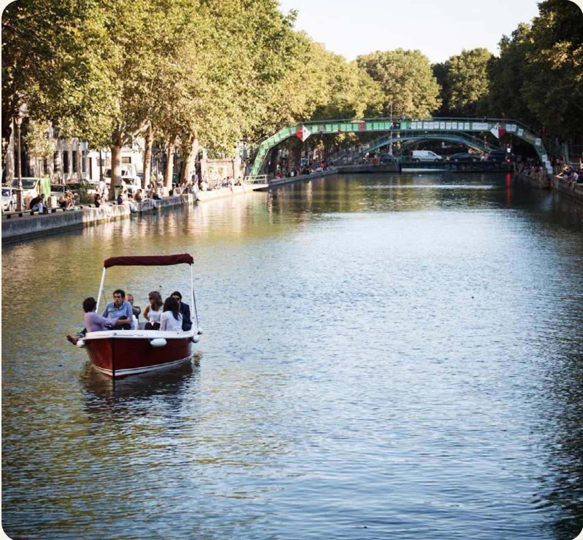
Canal Saint Martin