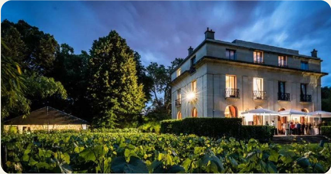
La Vigne de Paris Bagatelle

What if you could treat your guests to a party in the only private vineyard in Paris? Hidden in the Bois de Boulogne, La Vigne de Paris Bagatelle is a little-known but very special Parisian winery; one of the rare domaines making and selling « vin de Paris » in a former Maharaja's mansion, neighbour to the Duke and Duchess of Windsor's former residence. It's available for parties and weddings with the possibility to seat up to 170 people and welcome up to 350 for cocktails, overlooking the vines.