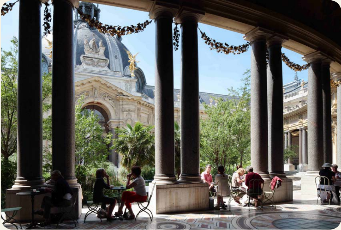
The courtyard of Le Petit Palais

If "budget" isn't even in your vocabulary for your fairytale wedding or party, Le Petit Palais and its spectacular interior courtyard cafe is also available for hire, available to seat up to 300.