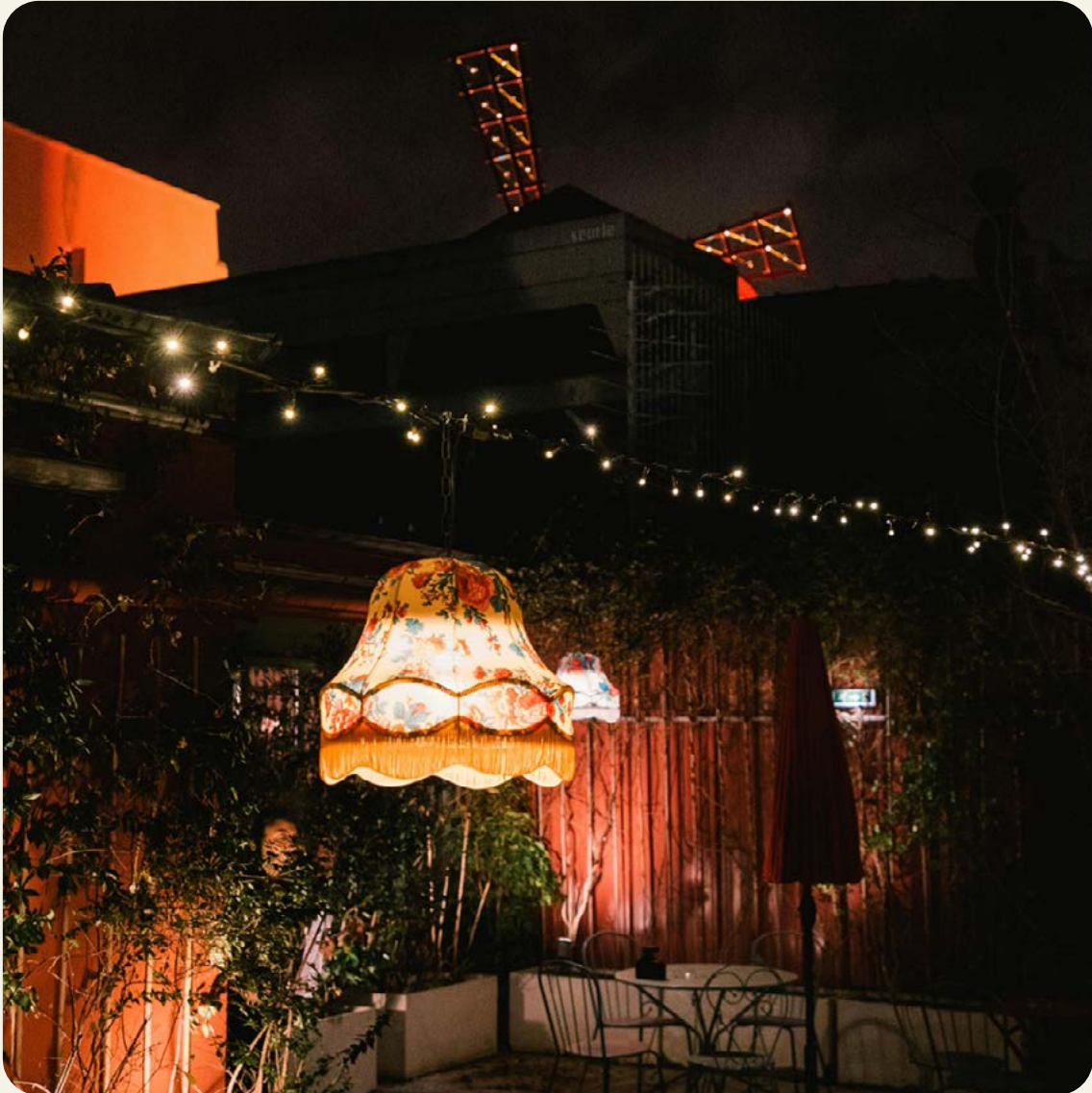
Bar a Bulles

Moulin Rouge-themed party anyone? Bar a Bulles - is a rooftop bar space at the back of the iconic Moulin Rouge . They have a huge space and throughout various rooms, can accommodate anywhere from 100-1000 people.