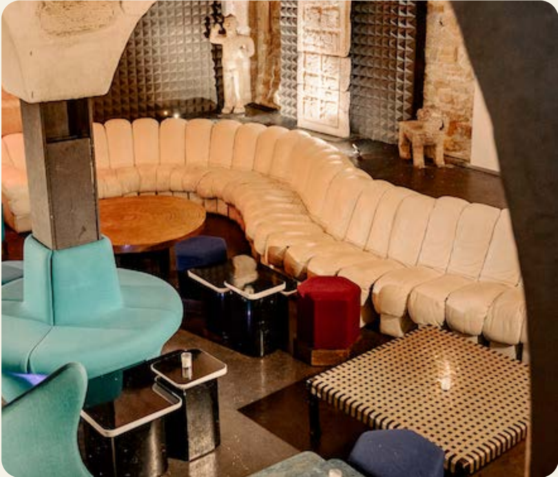
Serpent A Plume