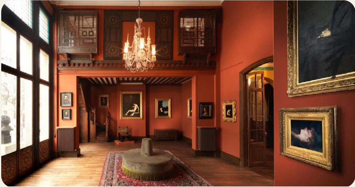
Musée Jean-Jacques Henner

The dress code should be “time travel” at the 19th century artist’s house-turned-museum that is Musée Jean-Jacques Henner . The space seems born for a luxurious, Agatha Christie style murder-mystery party, in period-specific garb of course. Good to know: the winter garden is available to hire for parties, as well as life drawing workshops to entertain your guests.