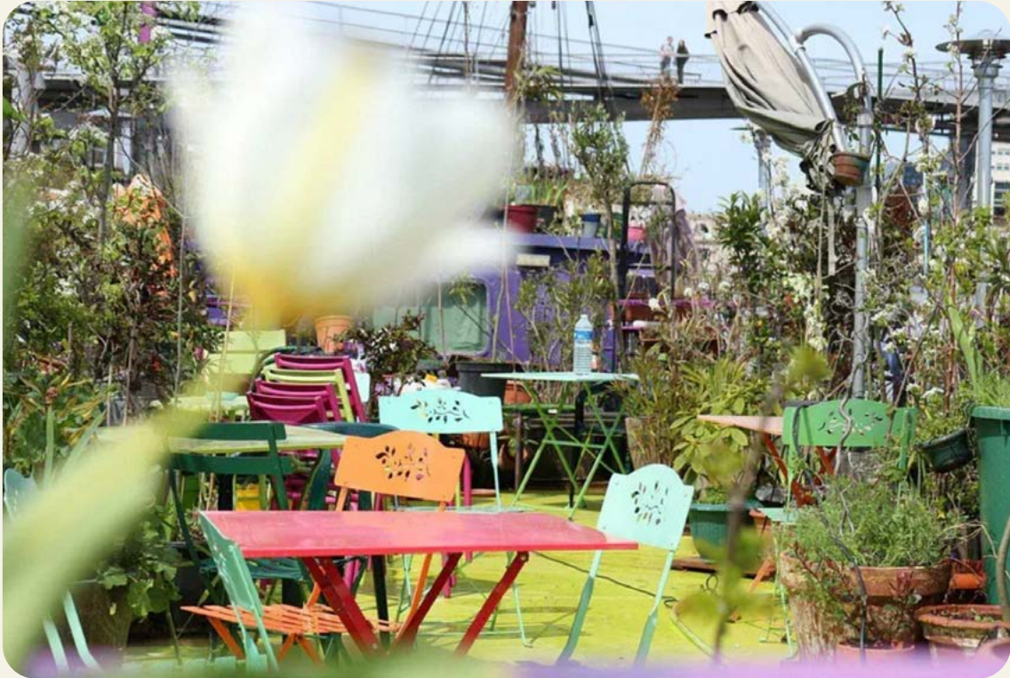
Le Jardin Flottant

La Nouvelle Seine, 3 Quai de Montebello, 5eme, 01 43 54 08 08; lanouvelleseine.com .