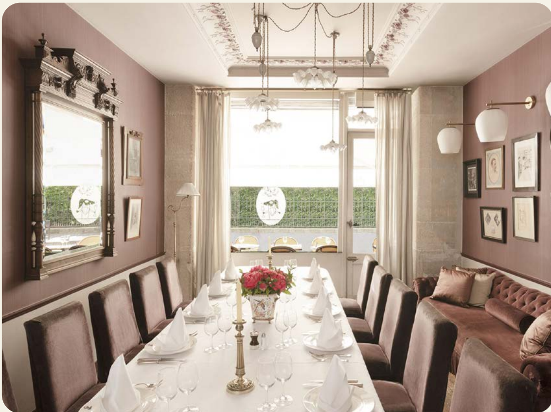
The private room at Le Square Trousseau

(1 Rue Antoine Vollon; 12ème; Capacity: up to 16 people; Reservations for the private room: +33 (0)1 4343 0600; squaretrousseau.com )