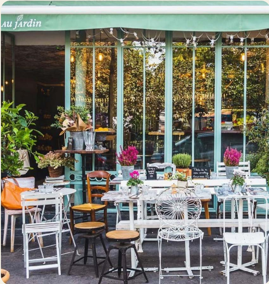
Treize au Jardin