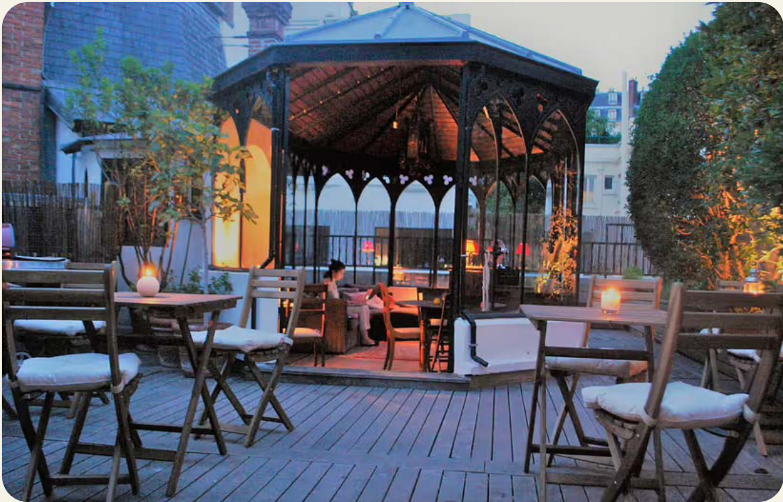
Sourire de passy

(29 Rue des Marronniers, 75016 Paris; ourirepassy.com )