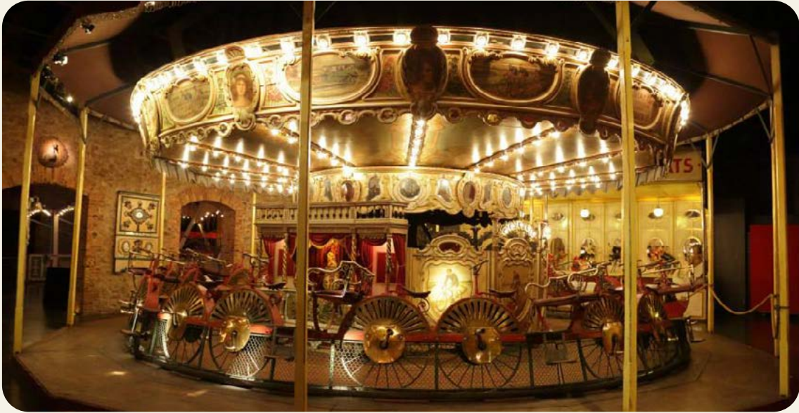
Cour du Mûrier

They have lots of experience doing privatised events and regularly work with caterers they can recommend. Here, you could turn your own party into a veritably private fairground.